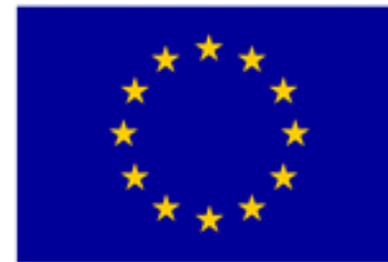
Euroopa Liit Ühtekuuluvusfond