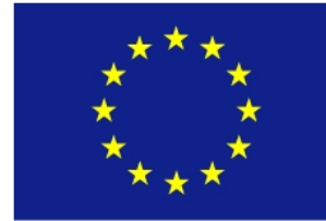
Euroopa Liit Euroopa Regionaalarengu Fond